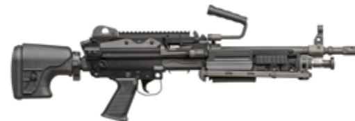
FN MINIMI® 5.56 Mk3 Tactical SF (Special Forces) with height and length adjustable buttstock (convex butt plate), folding shoulder rest, and short barrel