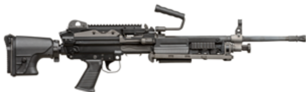
FN MINIMI® 5.56 Mk3 Tactical LB (Long Barrel) with height and length adjustable buttstock, folding shoulder rest, and long barrel

› FN MINIMI® 5.56 Mk3 Tactical SB (Short Barrel)